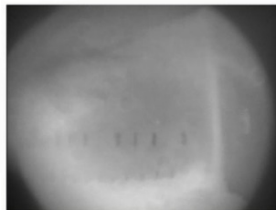
2nd Generation: 320 x 240 Resolution, Clear but Lacking Fine Detail