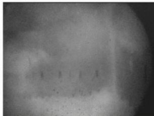
1st Generation: 320 x 240 Resolution, Grainy with Low Contrast

Our new detection core materials deliver improved pixel uniformity resulting in crisper images — See images below.